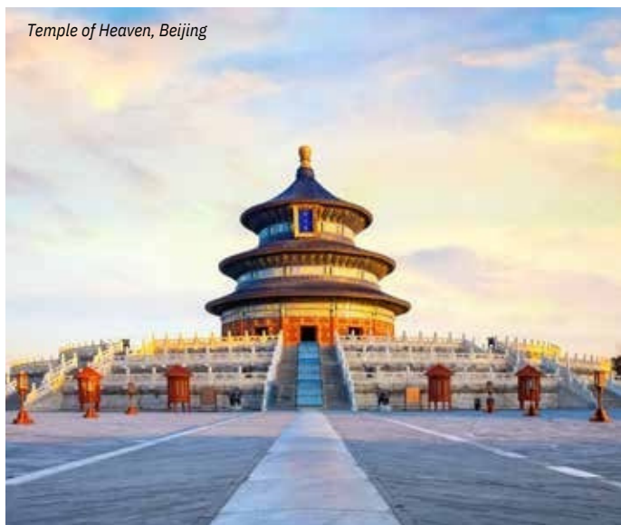
Temple of Heaven, Beijing

one of the world's largest public squares and a symbol of China's national pride and historical significance. Continue to the Forbidden City, the grand imperial palace complex at the heart of Beijing, which served as the residence of 24 Ming and Qing emperors. Next, visit the Temple of Heaven, an important imperial religious complex where Ming and Qing emperors conducted annual ceremonies to pray to Heaven for good harvests, reflecting ancient Chinese cosmology and ritual tradition. Conclude the day with free time at Hongqiao Market, known for its vibrant collection of shops offering pearls, handicrafts, souvenirs, and a variety of local goods.